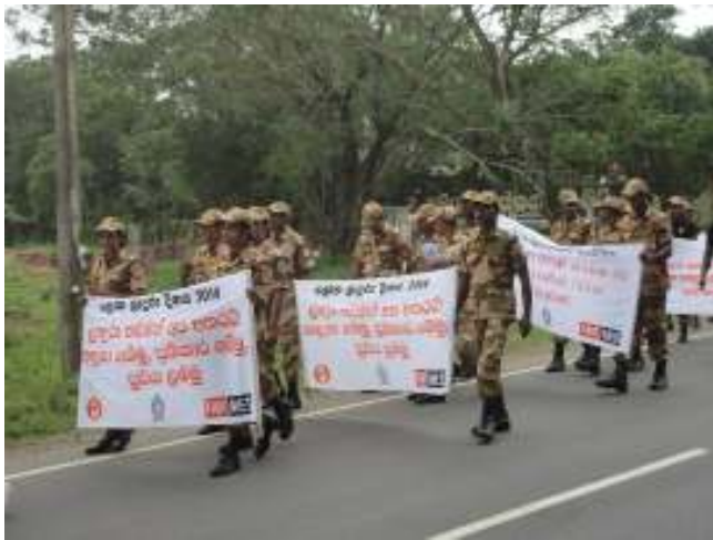
Leprosy Day walk in Ampara