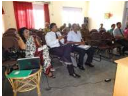
Review meeting at RDHS Ampara