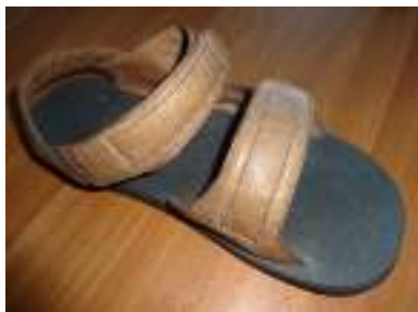
Sandal for Males