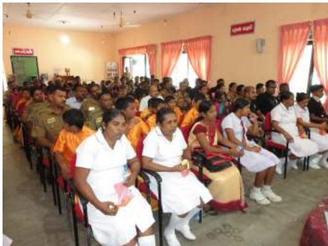
Awareness programme in Ampara