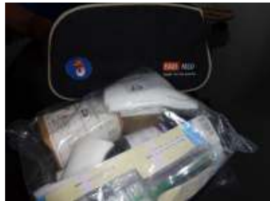
Ulcer care kits