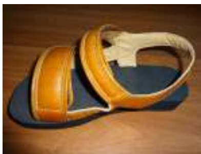
Sandal for Females