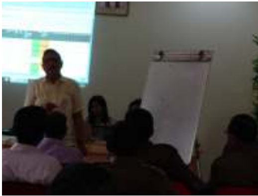
Review meeting at RDHS Hambantota

Quarterly review meetings were held in the Districts to discuss the progress of activities and in addition the Anti Leprosy Campaign conducted review meetings with the participation of FAIRMED FOUNDATION.